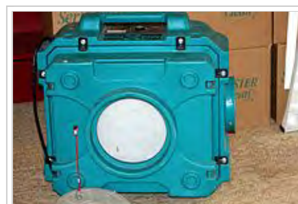
A portable HEPA filtration unit used to clean air after a fire, or during manufacturing processes.

The specification usually used in the European Union is the European Norm EN 1822:2009. It defines several classes of HEPA filters by their retention at the given most penetrating particle size (MPPS):