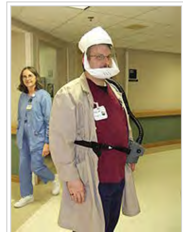
Hospital staff modelling a HEPA filter, which can be used if a patient has active tuberculosis

of "washable" filters. Generally, washable true HEPA filters are expensive. Some manufacturers claim filter standards such as "HEPA 4", without explaining the meaning behind them. This refers to their Minimum Efficiency Reporting Value (MERV) rating. These ratings are used to rate the ability of an air cleaner filter to remove dust from the air as it passes through the filter. MERV is a standard used to measure the overall efficiency of a filter. The MERV scale ranges from 1 to 20, and measures a filter's ability to remove particles from 10 to 0.3 micrometre in size. Filters with higher ratings not only remove more particles from the air, they also remove smaller particles.