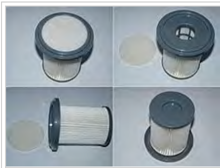
HEPA original filter for Philips FC87xx-series vacuum cleaners

passes through it. Finally, vacuum cleaner filters marketed as "HEPA-like" will typically use a filter of a similar construction to HEPA, but without the filtering efficiency. Because of the extra density of a true HEPA filter, HEPA vacuum cleaners require more powerful motors to provide adequate cleaning power.