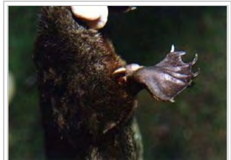
The calcaneous spur found on the male platypus's hind limb is used to deliver venom.

Both male and female platypodes ( Ornithorhynchus anatinus ) hatch with keratinised spurs on the hind limbs, although the females lose these during development. The spurs are connected to the venom-producing crural glands, forming the crural system. During the mating season these glands become highly active, producing venom to be delivered by the channeled spur. Echidnas, the other monotremes, have spurs but no functional venom glands. Although not potent enough to be lethal to humans, platypus venom is nevertheless so excruciating that victims may sometimes be temporarily incapacitated. Platypus envenomation was fairly common when the animal was still hunted for its fur. Nowadays any close contact with the animal is rare and restricted to biologists, zookeepers and fishermen (who occasionally catch them in lines or nets). [1]