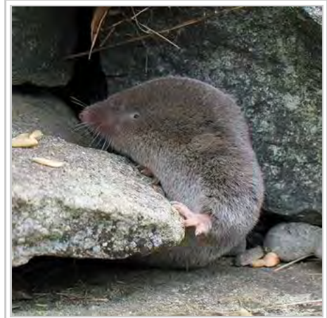
The Northern short-tailed shrew is one of several venomous shrews.

possibly also have a venomous bite. Shrews cache various prey in a comatose state, including earthworms, insects, snails, and to a lesser extent, small mammals such as voles and mice. This behaviour is an adaption to winter. In this context, the shrew venom acts as a tool to sustain a living hoard, thus ensuring food supply when capturing prey is difficult. This is especially important considering the high metabolic rate of shrews. Arguments against this suggest that the venom is used as a tool to hunt larger prey. Insectivores have an enhanced dependence on vertebrate food material, which is larger and more dangerous than their power to weight ratio would allow, thus requiring an extra asset to overcome these difficulties. [9] Extant shrews do not have specialized venom delivery apparatus. Their teeth do not have channels, but a concavity on the first incisors may collect and transmit saliva from the submaxillary ducts, which open near the base of these teeth. [10]