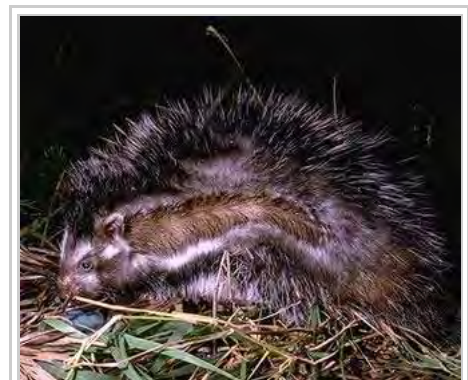
The African crested rat smears toxins on its flank hairs.

The African crested rat ( Lophiomys imhausi ) has a mane of long, coarse black-and-white banded hairs which extends from the top of the animal's head to just beyond the base of the tail. This mane is bordered by a broad, white-bordered strip of hairs covering an area of glandular skin on the flank. When the animal is threatened or excited, the mane erects and this flank strip parts, exposing the glandular area. The hairs in this flank area are highly specialised; at the tips they are like ordinary hair, but are otherwise spongy, fibrous, and absorbent. The rat is known to deliberately chew the roots and bark of the Poison-arrow tree ( Acokanthera schimperi ), so-called because human hunters extract the toxin, ouabain, from them to coat arrows that can kill an elephant. After the rat has chewed the tree, it deliberately slathers the resulting mixture onto its specialised flank hairs which are adapted to rapidly absorb the poisonous mixture, acting like a lamp wick. It thereby creates a defense mechanism that can sicken or even kill predators which attempt to bite it. [18][19][20][21]