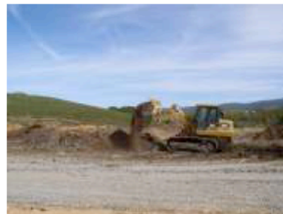
Composting Mortality at the Shenandoah County Landfill

Some county landfills accept animal mortality from farms in their locality. Landfills will either bury or compost the animal mortality. Availability, price and drop-off times will vary by county, so contact your local landfill or Extension Office for more information.