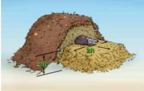
Figure 1: Composting Pile Construction Drawings by Bill Davis, Courtesy of Cornell Waste Management Institute

Composting is a controlled biological decomposition process that converts organic matter to a stable, humus-like product. The microorganisms that break down organic matter are naturally occurring (no special microbes need to be added to the pile). The combination of microbial activity and heat generated during the composting process destroy pathogens. Please note that many farmers think that composting involves placing the mortality in a hole with woodchips or other organic matter. This is not the case. As shown in Figure 1, composting occurs above ground.