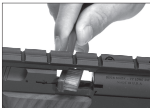
Clean with a nylon brush.

fouling should become heavy, it can be removed with a brass bore brush. Dip or spray the brush with nitro solvent and scrub the chamber and bore until the fouling is removed. To prevent brass bristles from breaking off, the brush should be pushed completely through the barrel before being withdrawn.