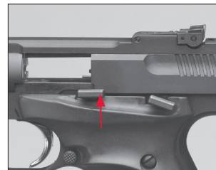
The slide release/stop latch is automatically actuated after the last cartridge is fired.

lever travels to its maximum upward movement and is completely engaged in the recess. Although the sear is now blocked, abusive handling such as a sharp blow could dislodge the hammer or otherwise cause the firing pin to move forward and discharge a cartridge.