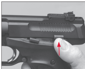
Engaging the manual thumb "safety."