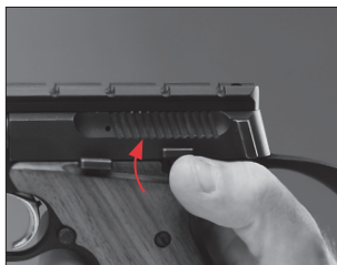
Engaging the manual thumb "safety."