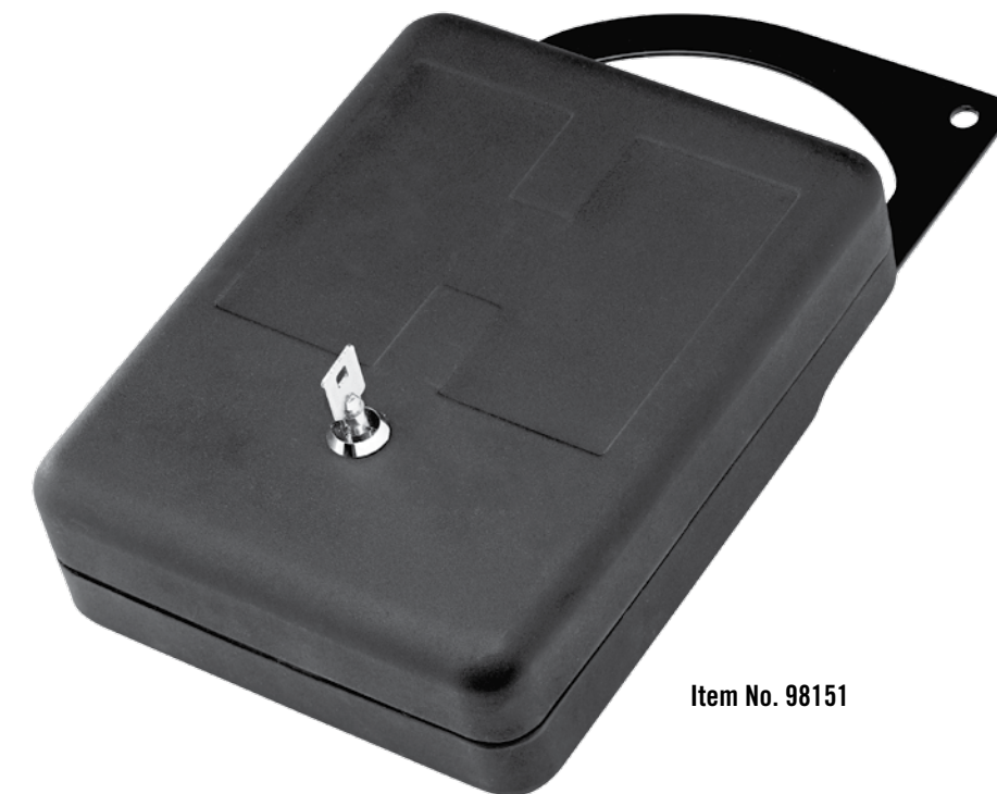
Item No. 98151